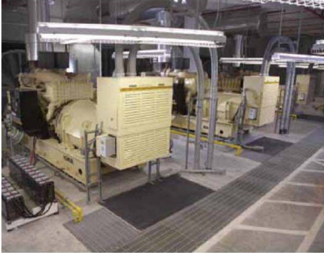
Figure 2. The University of Miami University of Miami Health System's Miller School of Medicine's generator plant features three 2.8 MW Kohler generators.

With a single large generator set, the standby power system is unavailable while undergoing routine or unscheduled maintenance. With a two-generator system, the generator set that is